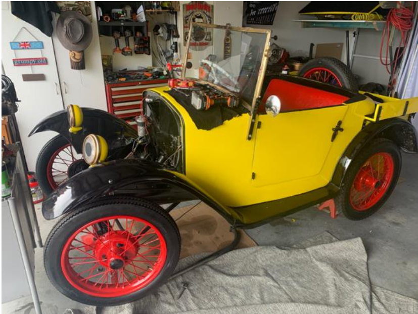
Glen Kelly's 1929 utility.