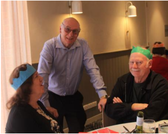
Snaps at the Christmas Luncheon.