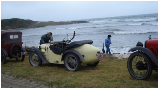
Ken and Fay's sports Austin 7 braved the wild weather of King Island when a team of us visited in 2011