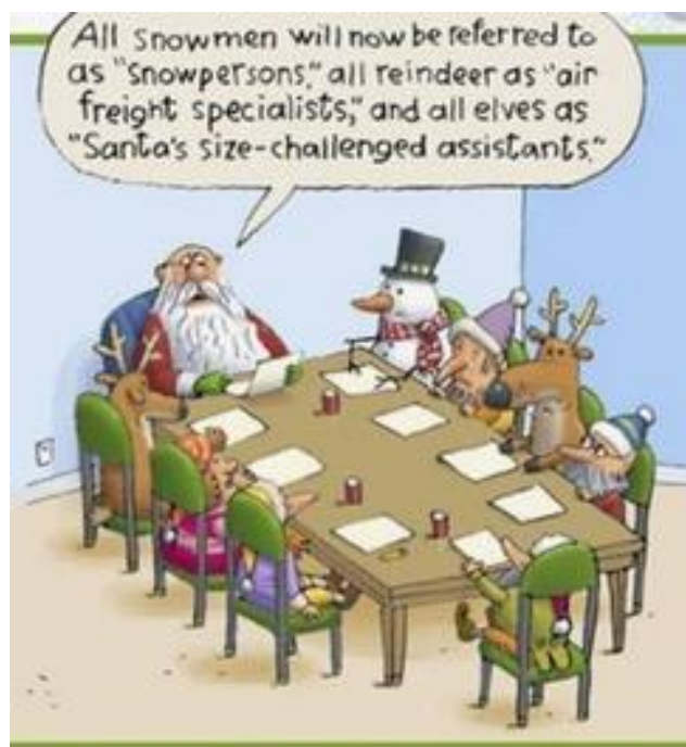
The Year Santa Hired a Consultant