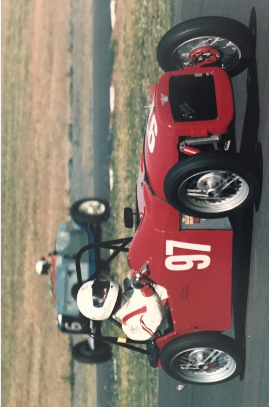
The Stringer Austin 7 Special - See article Page 20