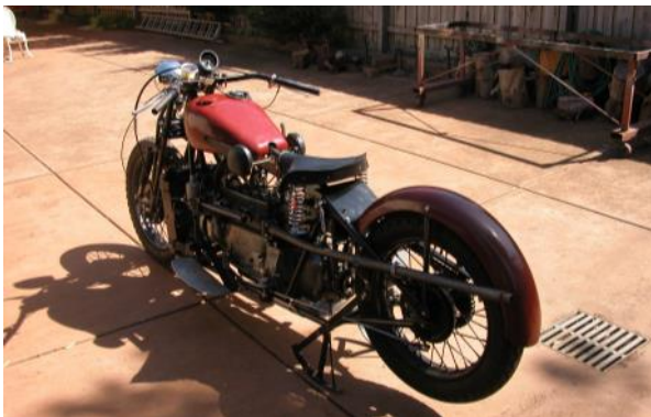
The Austin 7 engine motorbike in 2010.