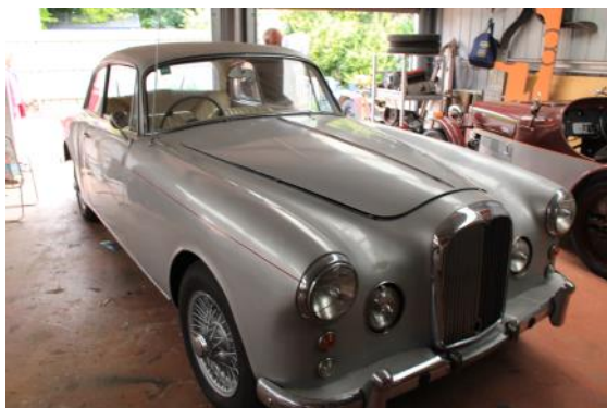
The Alvis Coupe that Warren rejuvenated and placed on Club Plates