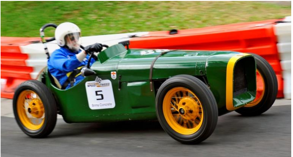
The Austin 7 Fleming Special